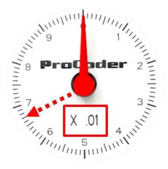
Read as 6.7 Multiplier is .01 6.7 x .01 = .067 or sixty-seven thousandths

1600 Alabama Highway 229, Tallassee, AL 36078 USA Tel: (800) 633-8754 Fax: (334) 283-7293 neptunetg.com