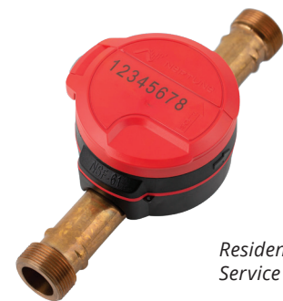
Residential Fire Service Meter