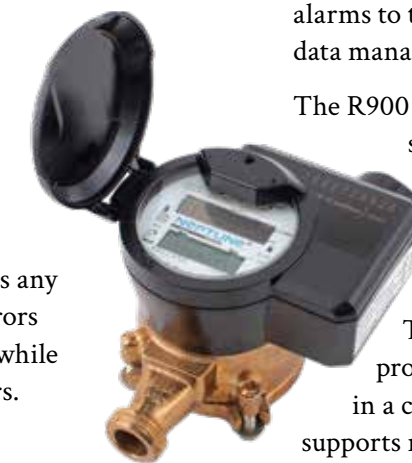
Neptune R900 endpoint

The Neptune R900 endpoint is designed and engineered to be ready and operational "out of the box." Shipped from the factory, the R900 endpoint is active and transmitting at predetermined intervals for operation on a LoRaWAN compatible AMI network, providing meter data as well as backup mobile AMR support without the need for any field programming. This approach simplifies and speeds deployment of endpoint hardware, as well as alleviates any concerns for errors in programming while installing meters.