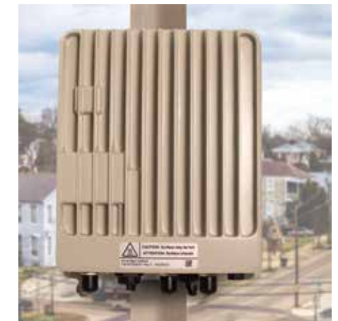
Neptune IoT Gateway

The R900® endpoint combined with the LoRaWAN network and Neptune's cloud-based data management platform, Neptune 360, provide key benefits in improved operational efficiencies, enhanced customer service, and distribution system optimization. Share and leverage actionable data captured by Neptune 360, empowering collaboration across your utility to manage Key Performance Indicators (KPIs) for billing, meter services and AMI network performance.