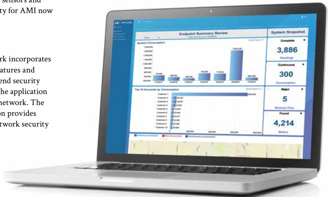
Neptune 360 Cloud-Based Data Management Platform

reducing IT support requirements. All that is needed is an Internet browser managed through secure login credentials. Ease your security concerns with a system monitored 24/7 that operates from a world-class data center and provides the highest level of security, redundancy, and disaster recovery services.