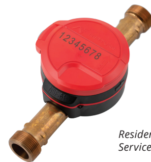
Residential Fire Service Meter