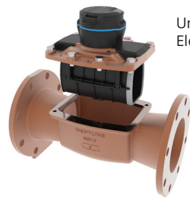
Unitized Measuring Element (UME)